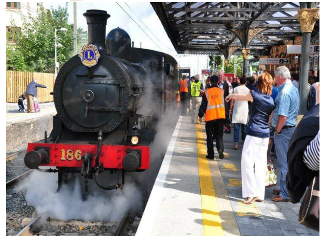
Steam Train at Malahide station departing for Wicklow