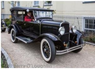
▶ CLASSIC & VINTAGE CAR SHOW RAISES FUNDS FOR LIONS CAUSES