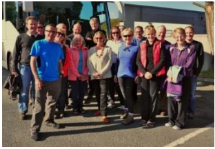
▶ “ANNUAL HILLWALK RAISES FUNDS FOR ST. FRANCIS HOSPICE