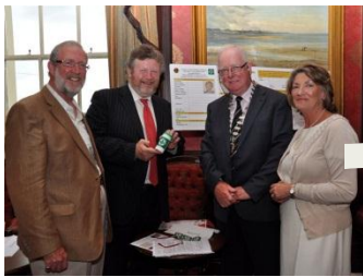
► HEALTH MINISTER LAUNCHES "MESSAGE IN A BOTTLE"