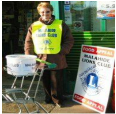
► CHRISTMAS FOOD APPEAL TO RAISE FUNDS FOR LOCAL NEEDY CASES